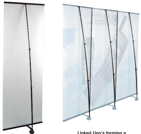
Linked Uno's forming a seamless graphic wall