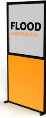
Add graphics and coloured framework