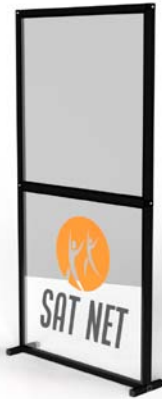
Coloured frame and graphics to acrylic