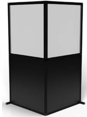
Join panels to create functional zoning