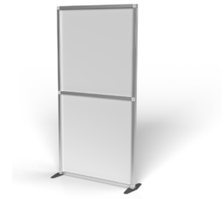
Single skin walls have exposed beams to the reverse.

AVAILABLE IN A RANGE OF STANDARD AND CUSTOM SIZES TO SUIT YOUR NEEDS.