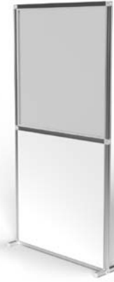
Acrylic top panel and Dibond or Foamex lower section