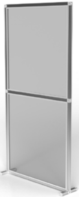
Two section acrylic panels and aluminium frame