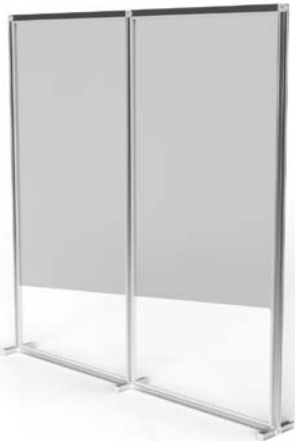
Whether you choose fabric, acrylic or a combination of substrates, the range of freestanding walling is certain to deliver the look you desire.