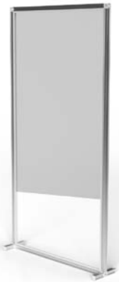
Full height acrylic panel and aluminium frame

Any combination of walling to transform your space.