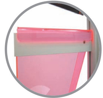
iPad Versa 1 and 2

Assemble additional components and accessories as required.