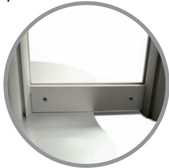
iPad Versa 1 and 2