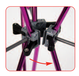
Fasten the sides together by closing each magnetic arm in the centre of the popup tower