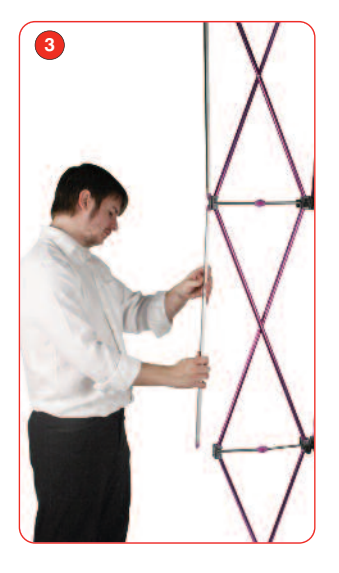
Attach the magnetic bars to the pop-up frame nodes